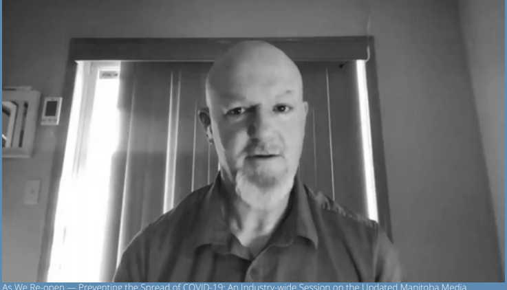
As We Re-open — Preventing the Spread of COVID-19: An Industry-wide Session on the Updated Manitoba Media. Production Industry COVID 19 Safety and Health Guide (March 2021).