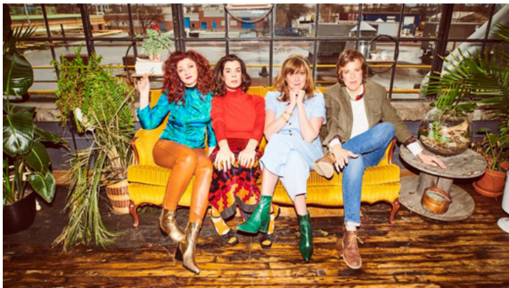
roness Von Sketch Show, Frantic Films. Various Directors.