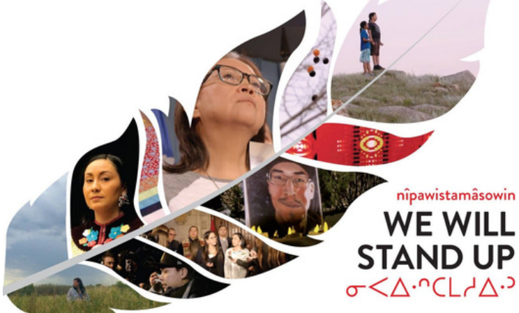
nîpawistamâsowin: We Will Stand Up, National Film Board of Canada. Dir: Tasha Hubbard